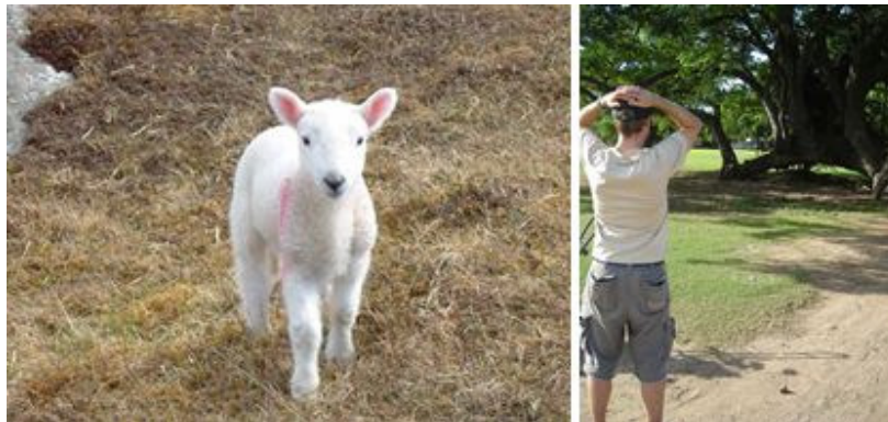
Mmmmm, home cooked lamb shanks!

Serve with crusty bread, mashed potato and your favourite garden vegetables.